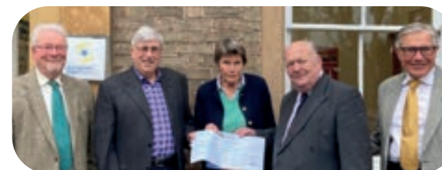
Photo of gentlemen from the Portcullis Masonic Lodge

A group of gentlemen from the Portcullis Masonic Lodge in Langport kindly visited us in March and presented a cheque for £1000 towards the Somerset Sight Tile Appeal and Kitchen upgrade.