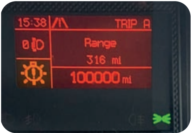
Photo of MAS Mileage at 27.02.2024