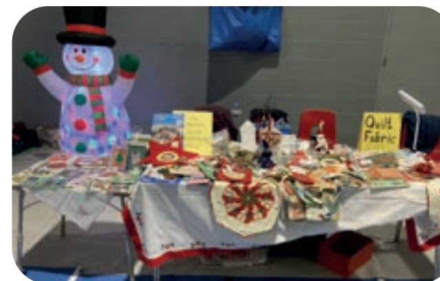
Photo of Craft Fair Stall with inflatable snowman