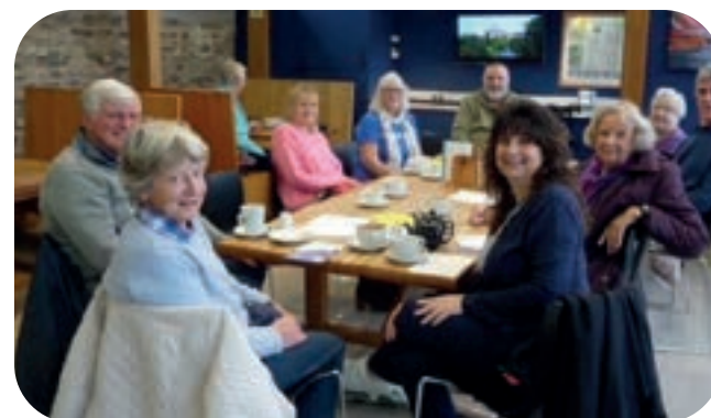
Photo of Wells Social Group

Due to interest shown and the success of Martock and Burnham-on-Sea, we are looking to start social groups in Cheddar, Minehead and Shepton Mallet. If you would like to be involved, please call us.