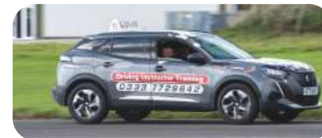
Photo of a Driving Experience

Half hour timeslots from 2pm but arrive from 12.30pm and have a tasty lunch at the Airfield café in the clubhouse before racing up the strip.