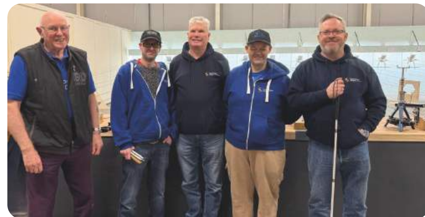
Image shows the Acoustic Rifle Team all smiling at their wonderful achievement

Out of 28 people attending from all over the world, Somerset Sight was the only team with more than one medal.