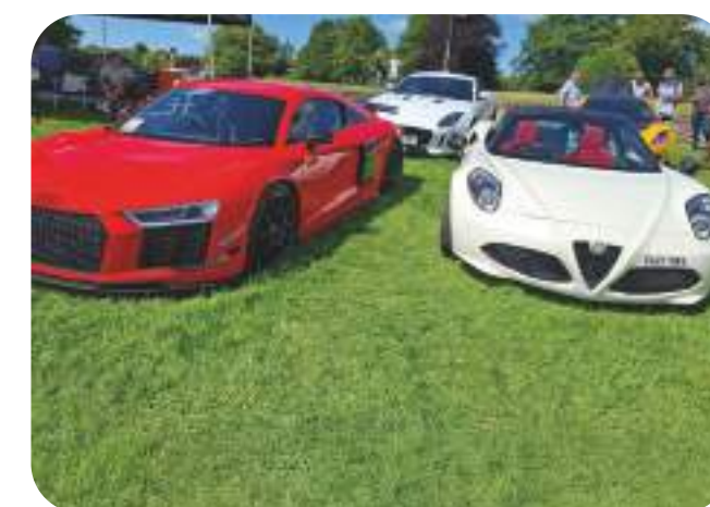
Photo of Supercars

https://www.sherbornecastle.com/sherborne-castle-classic-and-supercars/