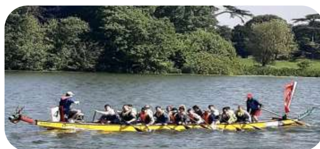
Photo of rowing crew

This annual event raises funds for West Country Children's Charities, and has lots of different attractions for everyone. The wonderful contribution from this event helps Somerset Sight to