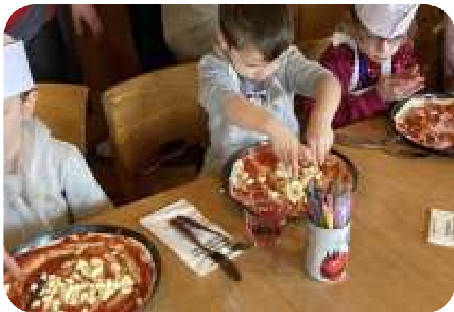
Photo of children making pizza

Thurs 30th Oct, 11:00am (meet at Northfield House at 10:45am) £10 per child. Customise your own pizza which you can take home afterwards. Followed by a Halloween magic show back at Northfield House.