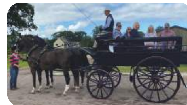
Photo of a Horse Drawn Carriage

Higher Hill Farm, Clayhidon, Exeter, EX15 3TW. £10 per person Enjoy a welcome drink, a light-hearted museum tour, learn about the history of the carriages and restoration projects in the UK and USA. Then enjoy a leisurely ride or two around the grounds in a horse drawn carriage. Please note the carriage has three steps up so is not suitable for wheelchair users or dogs. Please bring a picnic lunch for after the ride to sit, chat and enjoy the scenery.